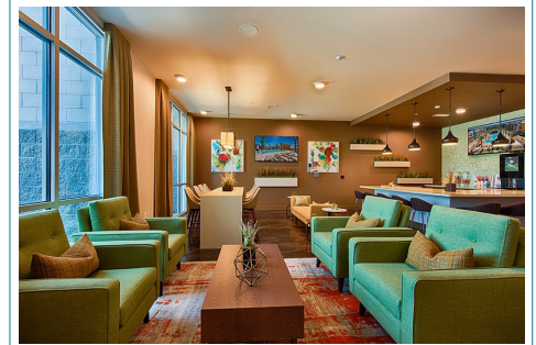
Tempo Apartments at McClintock Station in Tempe, AZ